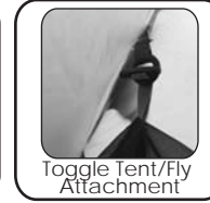
Toggle Tent/Fly Attachment