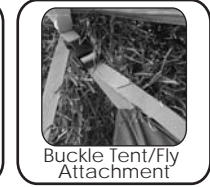
Buckle Tent/Fly Attachment