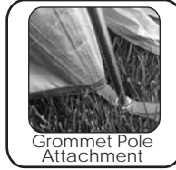
Grommet Pole Attachment